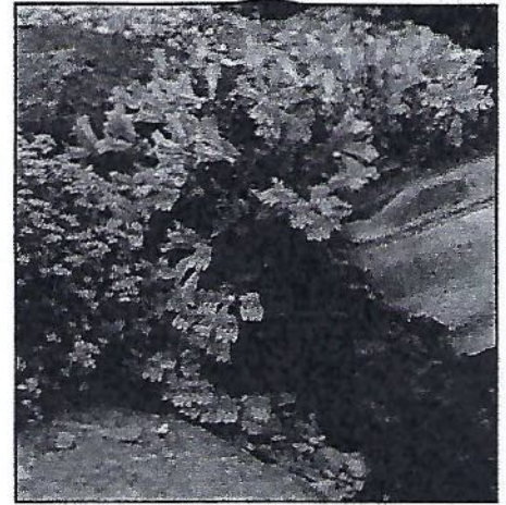
Penstemon fruiticosus v. serratus "Holly" from Wrightman Alpines

In the past the Wrightman order has been one of the highlights of spring. The plants come in very good shape, so its like Christmas in May!