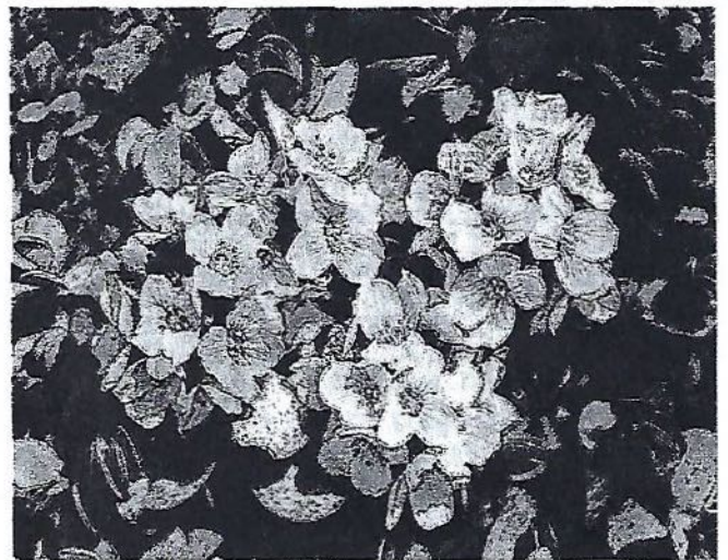
Aethionema oppositifolia , a choice member of the mustard family

A compact mound of opposite, evergreen, blue-green, smooth, rubbery leaves are covered with pale pink flowers in early spring. This unusual stonecress is native from Turkey to Lebanon, and has been growing well for a decade in Wasilla. It prefers sandy, gritty soil in full sun. It is propagated from cuttings or seed - though the seed need stratification to germinate.