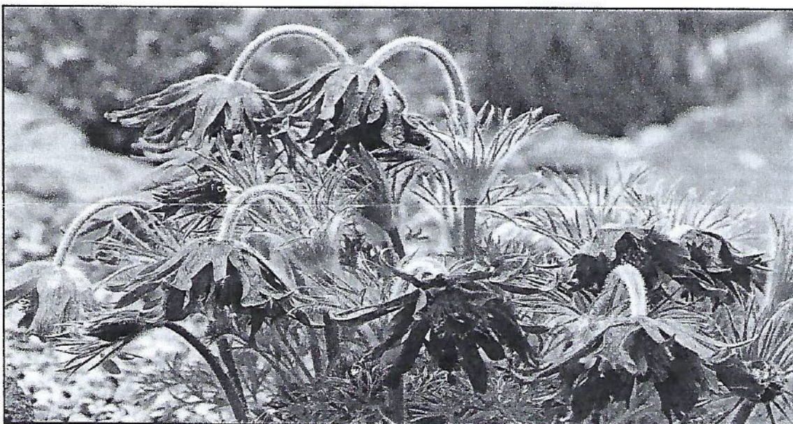
Pulsatilla vulgaris rubra

The native silverberry ( Alaëagnus angustifolia ) was a favorite of mine so I planted a four-footer in the top center of my hill. I also had two small blue spruce seedlings. I planted those higher up on the hill as well, keeping in mind they could be very tall someday. The silverberry has traveled all around those spruce saplings