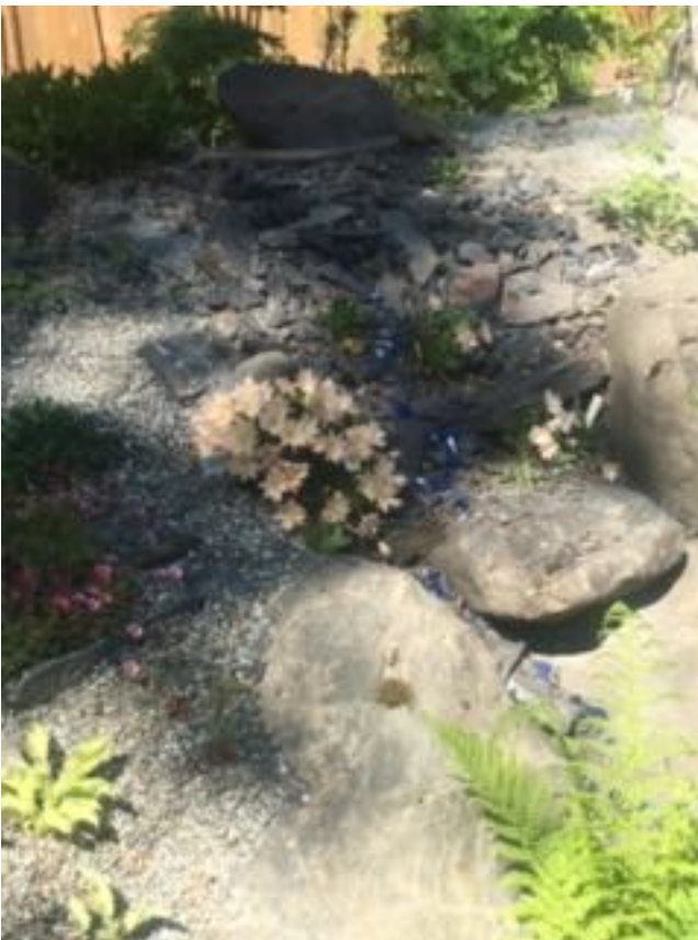
A beautiful Lewisia tweedyi flourishing in Ott's garden.